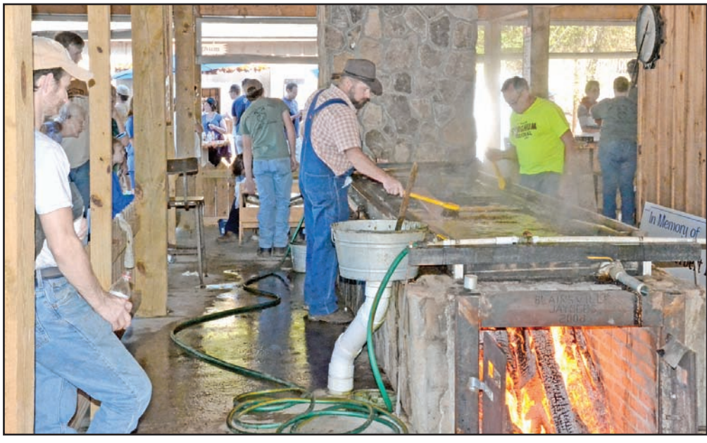
Cooking Sorghum at last year's Sorghum Festival

Community groups, as See Sorghum, Page 2A